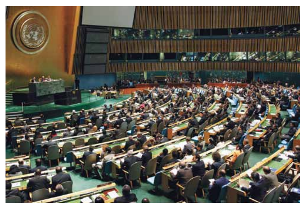
United Nations/Paulo Filgueira