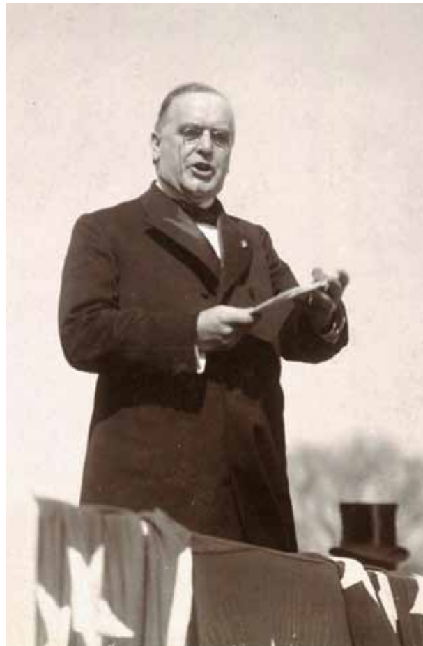
President William McKinley gives his Inaugural Address on March 4, 1897.

We are dealing with axioms of policy here, not reforms of existing struc-