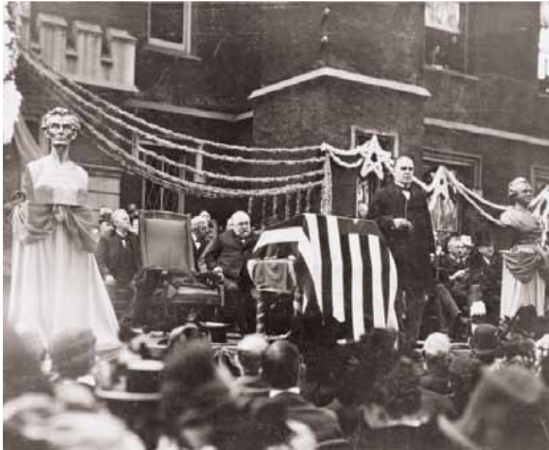
President McKinley speaks at the 40th anniversary of the Lincoln-Douglas debate in Galesburg, Illinois, in October 1898.

to four million slaves, and upon his act invited “the considerate judgment of mankind and the gracious favor of Almighty God.” He has received the warm approval of the one, and I am sure he is enjoying the generous benediction of the other.