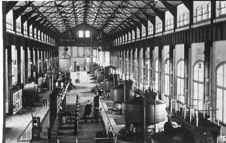
Two views of the 1901 Buffalo, New York Pan-American Exposition, the organization of which reflected McKinley’s commitment to international cooperation for technological progress.