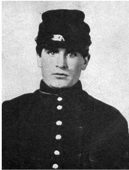
Brevet Major William McKinley during the Civil War. He was the last Civil War veteran to become President of the United States.

deserted. I weigh my words. This is the great question not only of the present, but is the great question of the future; and this question will never be settled until it is settled upon principles of justice, recognizing the sanctity of the Constitution of the United States. We cherish no resentments from the war; we have no bitterness against the people of the South. We want them to be our brothers, not only in name but in spirit and heart. We bid them enjoy equally our prosperity. But at the same time we bid them obey the Constitution of the country.... Nothing can be permanently settled until the right of every citizen to participate equally in our State and National affairs is unalterably fixed. Tariff, finance, civil service, and all other political and party questions should remain open and unsettled until every citizen who has a constitutional right to share in the determination is free to enjoy it.