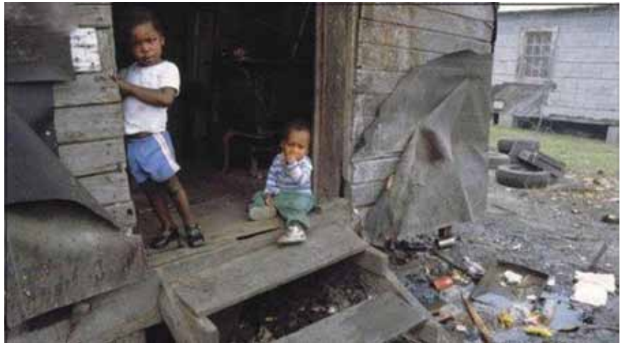
The living standards of the American black population as a whole reflect the "systematic intention to eliminate them," said LaRouche.

LaRouche: [laughs] Thank very much. Good to talk to you again.