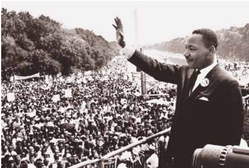
"A man who won't die for something is not fit to live," said Rev. Martin Luther King. Here he's shown addressing the Aug. 28, 1963 March on Washington.

future of mankind? Everyone dies. Every human being dies,—it is inevitable. Now, sometimes people are more fortunate in having a longer life; sometimes it's a worse alternative in their mind.