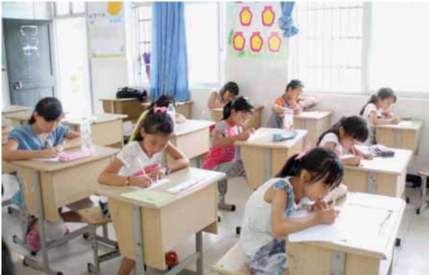
WANG Hongying/CC BY

Chinese students at a special summer camp set up on Luxi Island, a remote island off the coast.