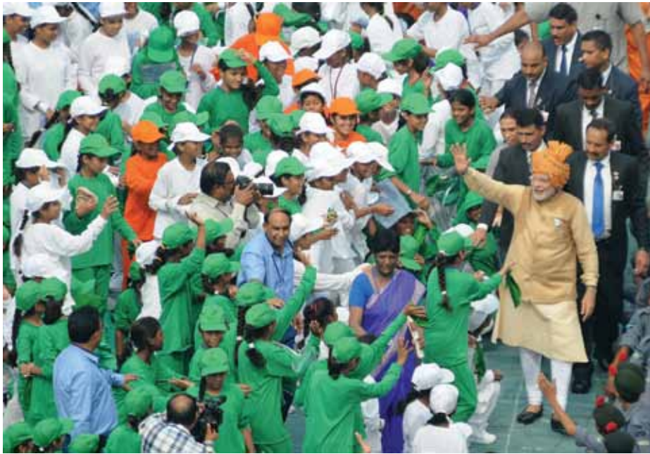
Press Information Bureau of India