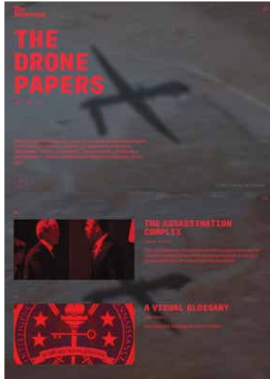
The Drone Paper released Oct. 15 by Glenn Greenwald's The Intercept have put vivid, documented evidence of Obama's record as a mass murderer on Congress's doorstep for action.

Now my view of that point is, severally, first of all, the whole thing, the whole show of that Tuesday debate