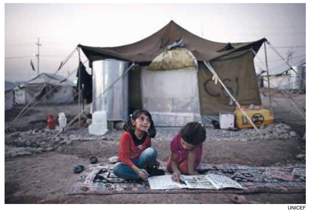
Syrian refugee children at an informal tented school in Lebanon's Bekaa valley in 2013. An entire generation is growing up without access to education.

It is a historic Islam vs. Islam conflict between the sword and the pen. Jihad was interpreted by some to mean spreading the Islamic faith by force, if neces-