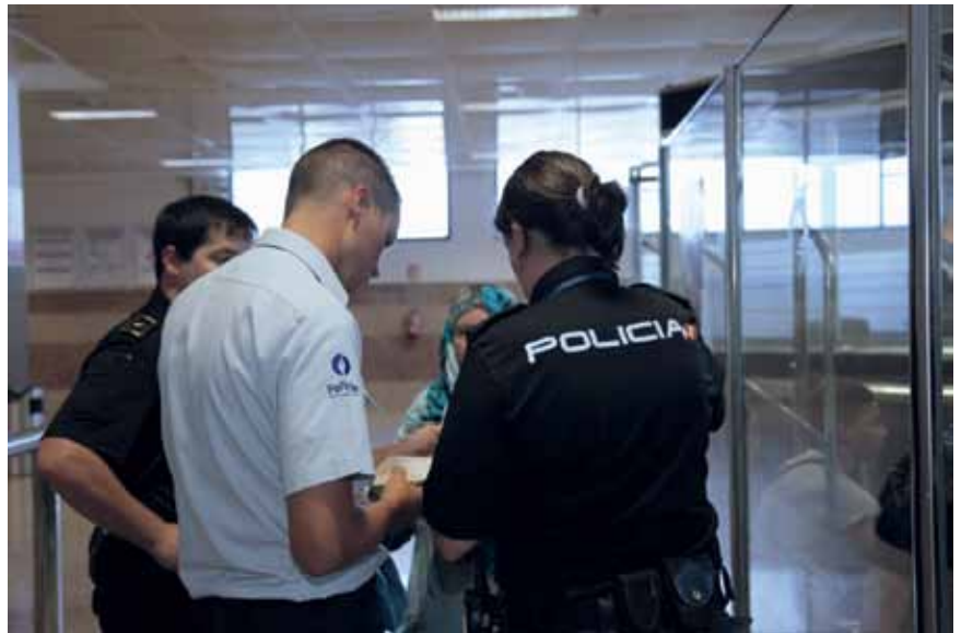
The European agency for controlling the EU's borders, commonly known as Frontex, interrogates a would-be immigrant.

Reports are that the organization would even be able to operate in states that are not members of the EU, and that the EU could disregard objections by member