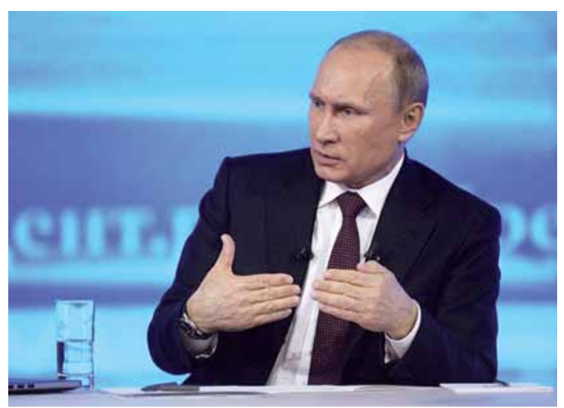
Presidential Press and Information Office