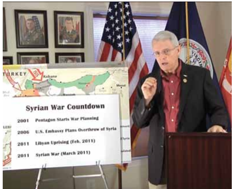
from Senator Richard Black's video message Virginia Senator Richard Black, in a video message he sent to the April 7 Schiller Institute conference in New York City.

Turkey runs along the northern border of both Syria and Iraq. Now what this map shows you here, the green portions are now controlled by the Kurds. You recall the heroic battle at Kobane? I have spoken to Kurds who were present on the Turkish side of the border. The Turkish army had protected the border with tanks, they put in 50 tanks. During the battle of Kobane, the Turks