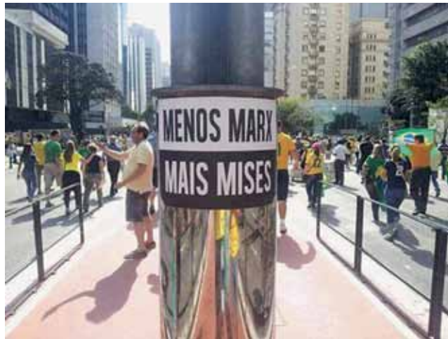
The sign “less Marx, more Mises” at a demonstration against President Rousseff in Brazil, was sponsored by the British empire’s fascist Austrian School of Economics.

Add to this that the leaders of the “social movements” organizing this color revolution, such as the Free Brazil Movement (MBL), are Margaret Thatcher-loving proponents of the British Empire’s fascist “Austrian School of Economics” associated with the infamous Friedrich von Hayek. The Austrian School’s Atlas