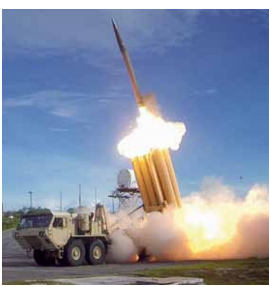
Missile Defense Agency