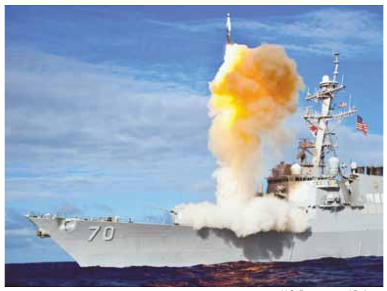
U.S. Department of Defense