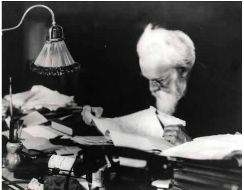
Vladimir Vernadsky, 1863-1945

The outer layer of the Earth must, therefore,