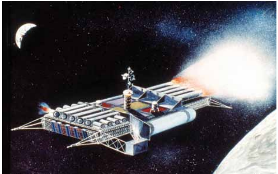
Ehricke's painting shows a nuclear-powered lunar freighter, which uses materials on the Moon for fuel. This is to be part of the transportation infrastructure that will open the Solar System to mankind.

The most advanced stage of development of lunar resources is the establishment of a Central Lunar Processing Complex (CLPC). The CLPC will be a processing center for raw materials, among them aluminum, silicon, iron, glass; intermediate materials such as silicon chips, solar panels, powered metals; and eventually finished products such as machinery, habitats, and so on. It will be supported by remote feeder stations, which will mine resources across the lunar surface and ship the raw materials directly to the CLPC. This will be done either via electric rail, or by a technology first proposed by Ehricke: taking advantage of the low-gravity environment and lack of atmosphere on the Moon, cargo deliveries could be catapulted on a ballistic trajectory to receiver craters.