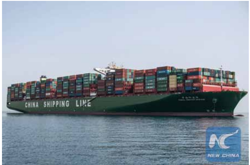
The container ship Indian Ocean, operated by China Shipping Container Lines, at the Gulf of Suez, Egypt, May 18, 2015.

The Eurasian Landbridge, the China-Mongolia-Russia Corridor, and the China-Central Asia-West Asia Economic Corridor will chart a path that will bring in-