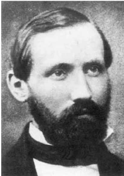
Bernhard Riemann (above) and Leonhard Euler (right). “Like Leibniz before him, Riemann’s discovery demonstrates that formal mathematical-physics schemes do not embody the potentiality of a truth-doctrine. To find truth, we must depart the domain of mathematics, and go over into another domain, the realm of experimental physics.”