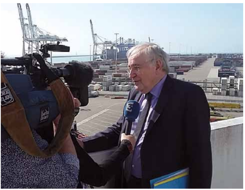
Solidarité & Progrès

Interviewers are intrigued by this idea: "Just who are the financial occupiers?" Cheminade gives examples: In 1979 the French debt was equivalent to 239 billion euros, and it was held essentially by the large French banks; today it is 2.17 trillion euros, and it is