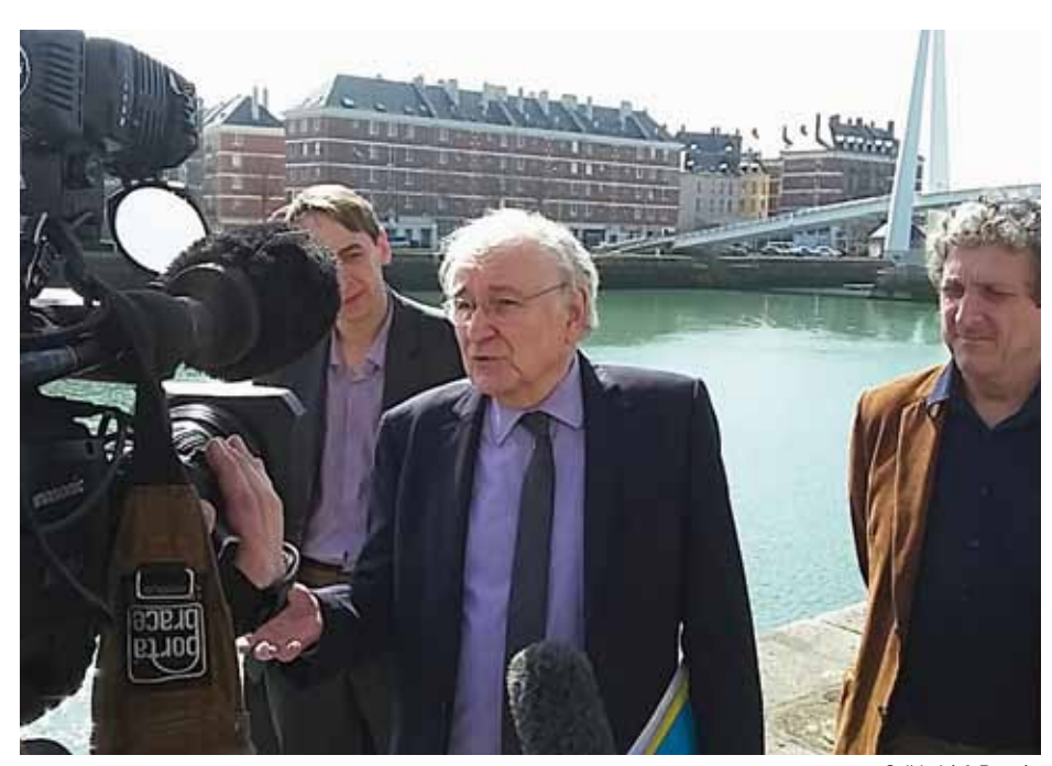
Jacques Cheminade in Le Havre, France.

And I agree with Asselineau: we must leave the present Europe as it is, i.e. the European Union of the euro, and NATO which is its armed branch—not to jump into the void, but to create a true Europe, another Europe which corresponds to what Charles de Gaulle and the founding fathers had dreamed of: a Europe of nations and projects, of sovereign nation-states—and it's with that Europe that we must move towards great projects. And there, with the BRICS and with China who are proposing a 'win-win' system, this new Europe must ally around a project, another type of economy in the world which will no longer be under the dictates of