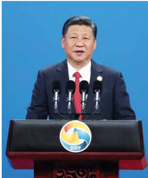
China's President Xi Jinping delivers the keynote address at the Belt and Road Forum, May 14, 2017.

Xi then laid out five characteristics of the Belt and