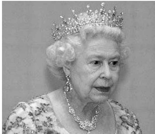
Commonwealth Heads of Government

The search for any actually truthful insight into the matters to which I have just pointed immediately above, must overcome those systemic difficulties which tend to block the pathway to rediscovery of the actual meaning of truth for what is presently identified as "physical science," as that science was properly understood by such exceptional minds as those of Nicholas of Cusa and Johannes Kepler, and, perhaps, much earlier, the water of Heraclitus' science, too. Unfortunately, present academic and contingent sets of educational practices, have lately tended to discard the high standard for science which had been that such as what Max Planck and Albert Einstein had represented in their time. Whereas, their opponents from the ranks of the late Twentieth and early Twenty-first centuries, have tended toward the brutishly crude, ideological practices, practices which have polluted what had been formerly the honorable, scientific classrooms, now supplanted by the thuggery of Bertrand Russell's legacy.