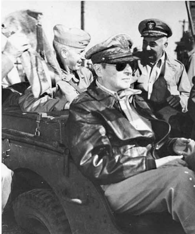
While even the most influential people fail when it comes to forecasting, “MacArthur’s decision at Inchon demonstrates the case of the truly leading type of creative personalty (it was Harry S Truman who had things bass-ackwards).”

tant occasions, even crucial ones, as General Douglas MacArthur’s decision at Inchon demonstrates the case of the truly leading type of creative personalty (it was Harry S Truman who had things bass-ackwards). The state of corruption of what had been competently trained scientists, has often not been the outcome of failed attention to a competent science; it is folly which seeks silly solace in some set of popular opinions.