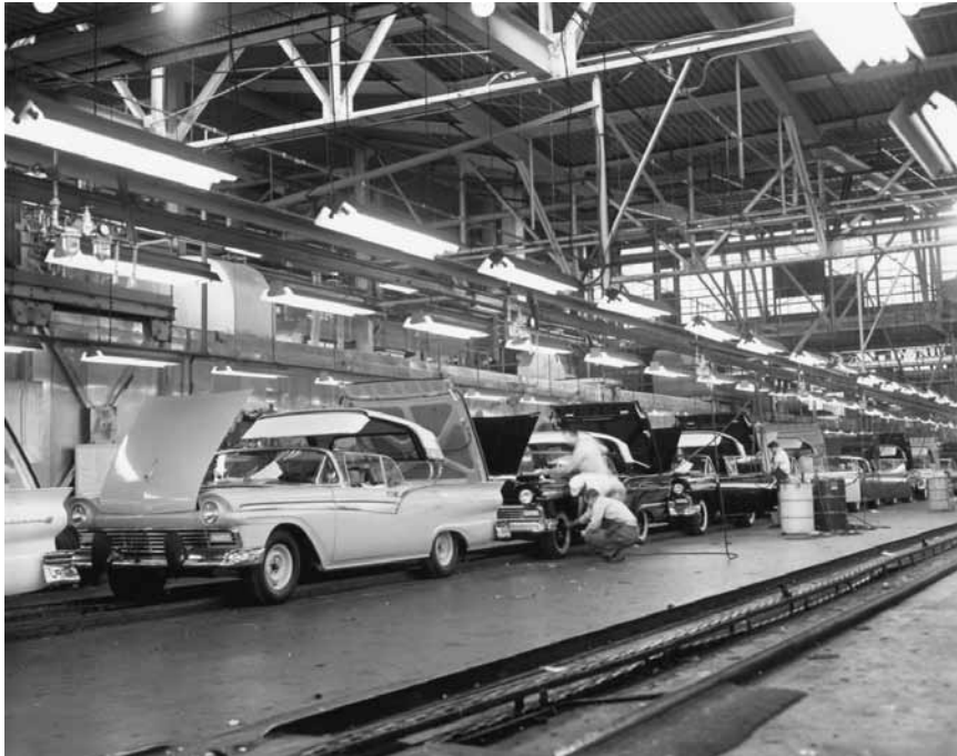
Ford Motor Co.

LaRouche's forecast of the crash of the "great U.S. auto industry of the 1950s," was the first in a series of comparable forecasts which he has supplied over the decades since, up until the present time. Shown: A Ford assembly line, 1957, Lorain, Ohio.