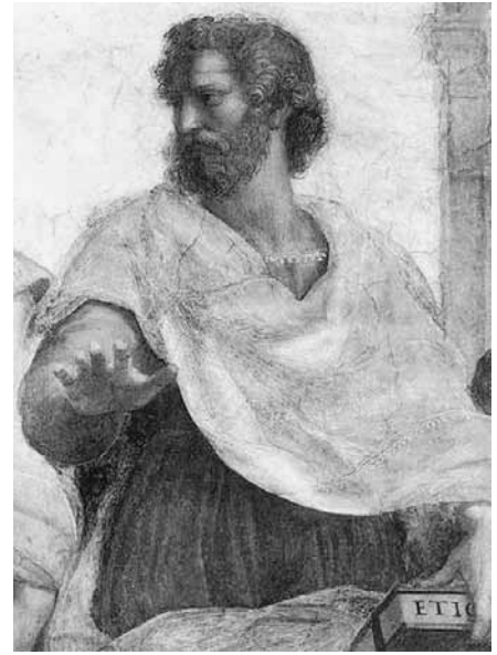
The hoax of sense perception: "Most among the common frauds presented in the mere name of science" are typified by the cases of Euclid and Aristotle. . . . Euclid (left), and Aristotle, as portrayed by Raphael in the "School of Athens" (1509).

was in progress, as during my early adult manhood, had drawn me to think in "Classical poetic" or like veins, as a means of defense against the unwanted intrusions emanating from the classroom and its like.