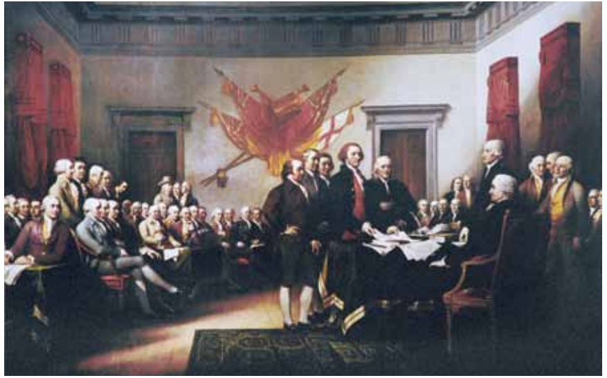
The signing of the Declaration of Independence.

friends to understand this point: It means that Europe must break away from geopolitical rule to be truly itself, and European nation-states must work together for common projects, and therefore not give in to that geopolitical rule, one-by-one or together. It should be clear that the present-day European Union is based on a betraval of the best historical and cultural sources of Europe—and I mean sources, not roots clinging to the ground. But it should also be clear that the European nations and their leaders, and their so-called populist opponents as well, have also given away their souls. Therefore, where is hope? What could our European contribution be? It obviously lies in the sense of an understanding of what a nation-state is, something which is latent, even if concealed, in the hearts of all true Europeans. Our task is to inspire an awakening from the sleep of reason.