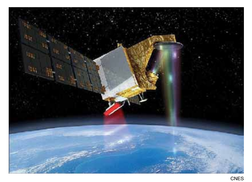
Artist's rendition of the deployed CFOSAT spacecraft in orbit.

Concretely, there is a lot to share, provided there is a political will and not ideological mistrust. I have been told so many times, that if scientists organize their own channels of communication, they work very happily together because science does not belong to one single country, but to all of us, to build a better world. But the problem in all ventures is the lack of collaboration from the European administrations, which, too often, think in terms of the Chinese situation of five to ten years ago, without taking into account the enormous progress accomplished in China in the most recent years. The French seem to be even more bureaucratically paralyzed than the Germans: There are presently about 5,000 Chinese doctoral students in Germany, but only 500 in France. The last Franco-Chinese science com-