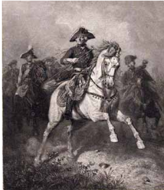
Frederick the Great

It's been said that Robert Mueller is very linear in his thinking. I would suggest that Robert Mueller's office is probably about 36 lawyers deep who are hostile to President Trump, favorable to Hillary Clinton, and work with the British. That's very definitely to our advantage in this situation. Lyndon LaRouche continues in this piece: "Prussian troops under Frederick the Great's command did what the Austrians had assumed to be an impossible deployment—scampering." But I highly recommend scampering when it serves a strategic purpose. "Surprise lies in the mind of him who either does not know or is self-blinded by his refusal to know, like the routed Roman commanders at Cannae."