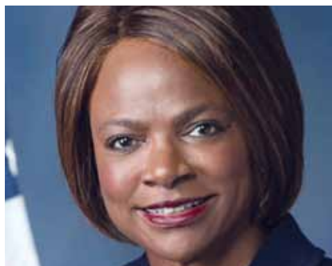
United States House