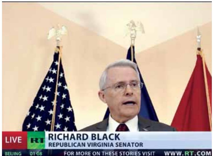
Sen. Black questioned the wisdom of H.R. McMaster’s National Security Strategy report.

Schlanger: What you just identified gets right to the core of what the fight is in the United States. While it’s true that the Trump proposal on infrastructure so far is