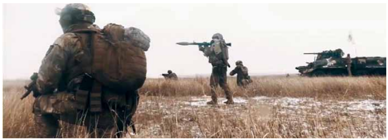
Nazi Azov Battalion in action in Ukraine, Feb. 25, 2017.