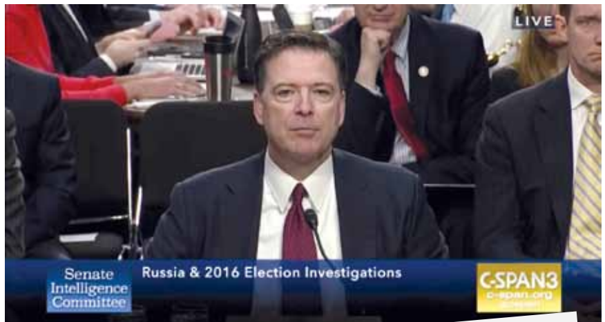
Former FBI Director James Comey testifying and Victoria Nuland, both under fire.

This is all extremely, extremely hot, and there are now all these Senate and Congressional hearings and committees investigating this. Congressman Nunes,