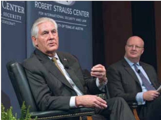
University of Texas, Austin

U.S. Secretary of State Rex Tillerson (left) at the University of Texas in Austin, Feb. 1, 2018.