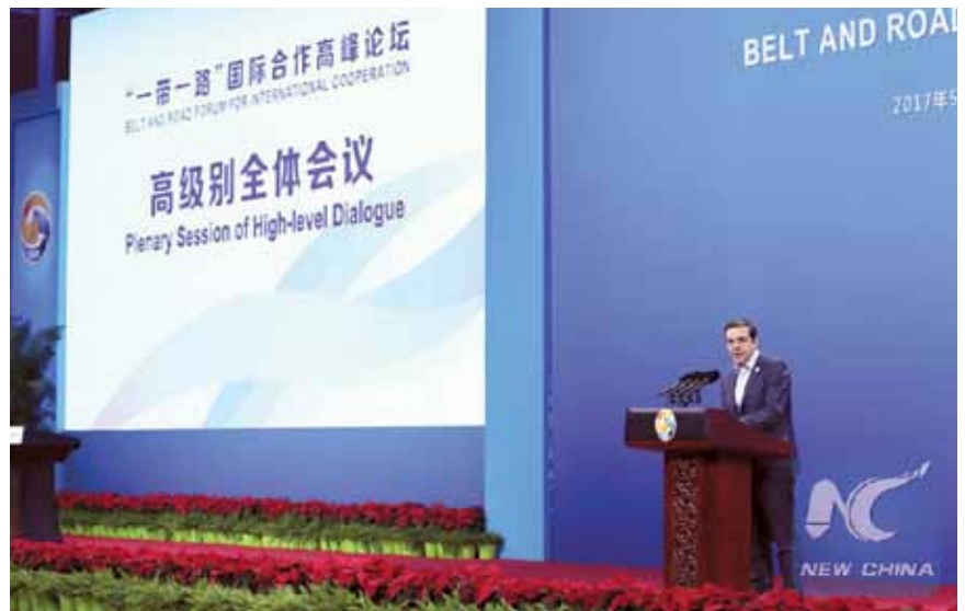
Greek Prime Minister Alexis Tsipras at a plenary session of the the Belt and Road Forum for International Cooperation, in Beijing, China, May 14, 2017.

In the article in the Global Times , they say that all of