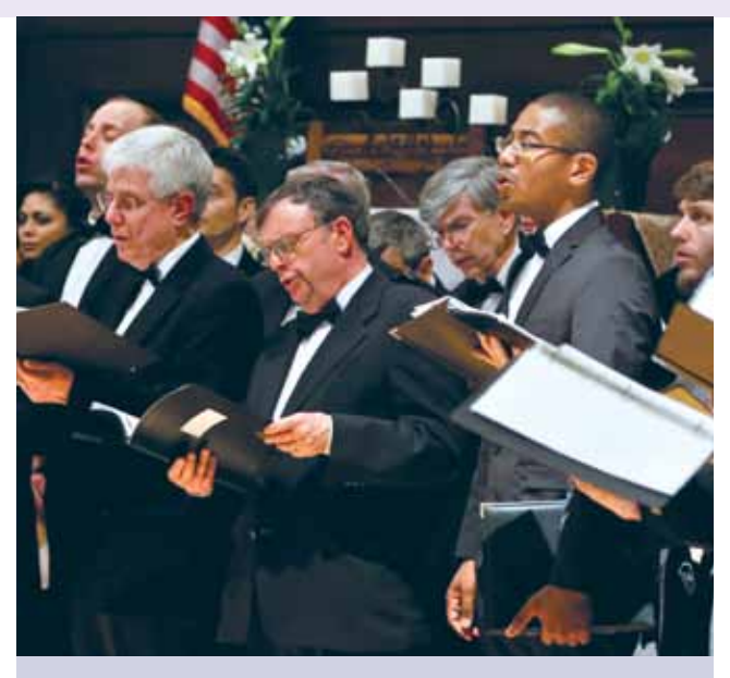
Schiller Institute New York City Charus

http://www.sinycchorus.com/dona_nobis_pacem_1968_2018