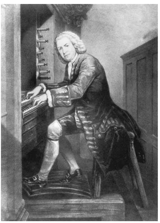
From a print in the British Museum.

What is even more shocking—earth-shaking—is that the ability of the individual human mind to compose agapic well-tempered polyphony is the "proof of