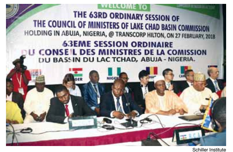
The Council of Ministers of the Lake Chad Basin Commission conference, February 2018.

China is playing, then Europe is out, or if Europe is playing, China is out. We need the cooperation, the collaboration of all three, because it's not just Europe and China either; Africa is also at the table and there is a need to ensure that Africa is always represented, and is part of the discussion that develops any solutions, be they infrastructure, development, migration, what-have-you, Africa needs to be a part of it.