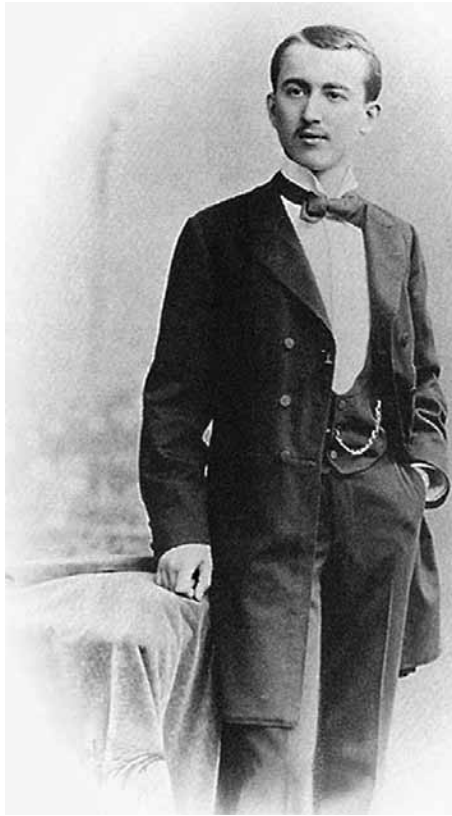
Milutin Milanković, Serbian Astronomer, as a student (1896-1902) in Vienna.

In 780,000 B.C., the most recent, long-lasting magnetic pole reversal occurred and evidence indicates that there have also been more recent and more temporary magnetic pole reversals. North/South reversals of the earth's magnetic field are very interesting events whose causes and effects are still not fully understood. What is known is that the drawn-out process of a shift in the magnetic pole from north to south (or vice-versa) can take many years, during which the magnetic field of the earth may be significantly weakened. This could result in a sharp increase in solar radiation entering the atmosphere.