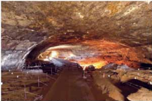
Floodlights illuminate an archaeological site inside Wonderwerk Cave in South Africa.

RELATED TAGS: ARCHAEOLOGY, HUMAN ORIGINS