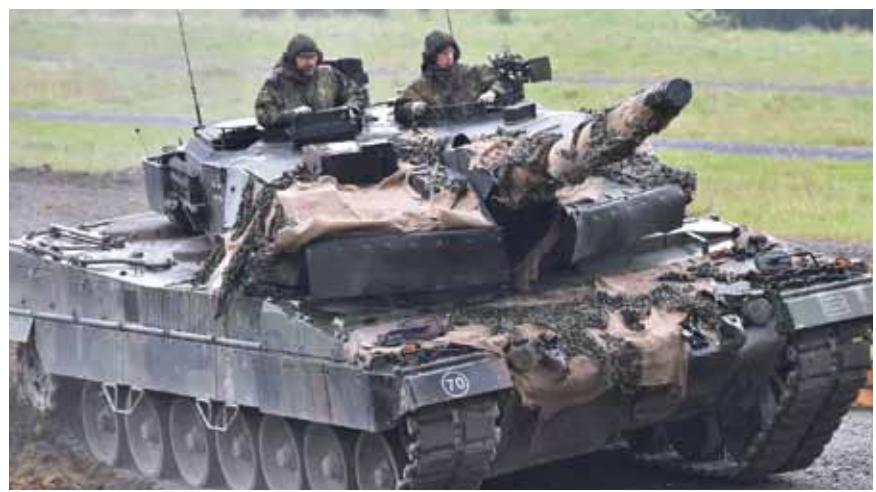
U.S. Army/Gertrud Zach