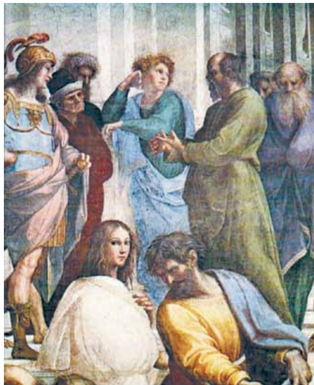
"Mankind is so gripped by their own fearful prescience of human mortality, that they do not even suspect the purpose in mortal life which they should be seeking." Raphael's "School of Athens" (1510), in the Vatican, portrays the principle of immortality. Shown: a detail, with Socrates (second from right), in dialogue with other members of the Platonic Academy.

The problem has been, that most people, still today, (empiricists, for example) do not believe that they actually possess a "soul," except as a Sunday-go-to-meeting dress which they have borrowed for the occasion. There is a reason for this phenomenon; that is, that the victims of such an induced outlook treat themselves as loyal subjects of what Aeschylus portrayed as the Olympian Zeus of the Prometheus Bound . They accept the obligation to deny the actual principle of human individual creativity which is the difference of man from beasts, as a quality which does not lie within the bounds of the mortality assigned to the beasts. They accept the status of virtual cattle, which British empiricism, such as that of slave-trader John Locke, assigns to people. They accept the view of that willing slave, who does