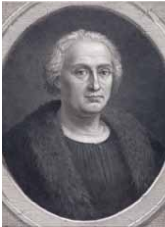
Library of Congress

Following the intention of the great Cardinal Nicholas of Cusa (right), and of the 1439 ecumenical Council of Florence, to outflank the domination of Europe by the Venetian oligarchy, Columbus (left) was inspired to cross the Atlantic to found a new world, free of such evil influences. The painting (ca. 1460) by Benozzo Gozzoli, depicting the procession of the Three Magi to Jerusalem (in the persons of the Medici), was understood at the time as portraying the arrival of participants to the Council of Florence.