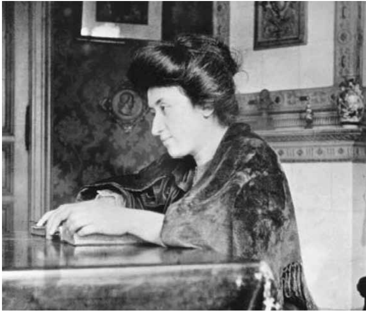
Rosa Luxemburg Foundation

Rosa Luxemburg (1870-1919), “the brilliant daughter” of a German labor leader, was right on economics, when the so-called “orthodox Marxists,” V.I. Lenin and others, were wrong.