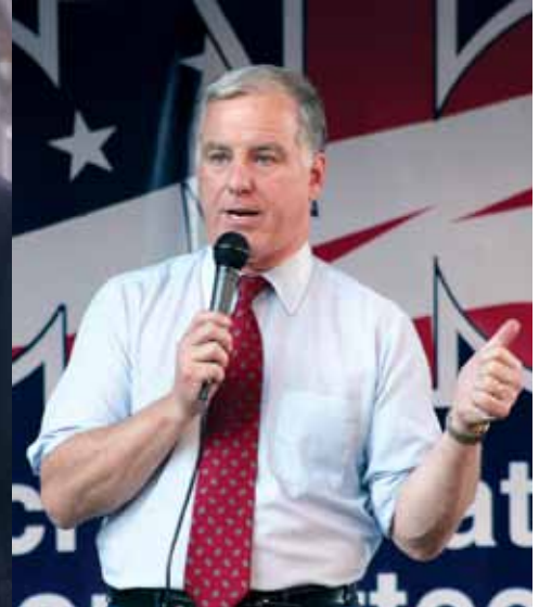
Under the reign of Barack Obama- and Howard Dean-funder George Soros, the privileged get the dollars; the others get the "change." Left to right: Soros, Obama, Dean.

privileged class's snickering escape from the threat of overseas military service, as later Vice-President Al Gore had done, fear and hatred of the perceived loss of elitist privilege, combined with the triggers of the March 1, 1968 crisis of the U.S. dollar and "Tet Offensive," became the special detonators of all that was really necessary to detonate the riotous reactions of 1968 and beyond.