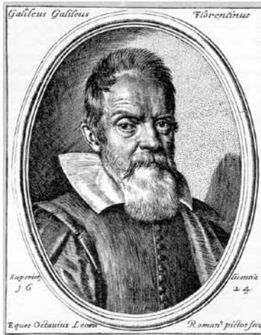
Belief in Newton, writes LaRouche, “is a matter of pagan religious belief, not science. The cult of Isaac Newton can be traced chiefly to Sarpi’s lackey Galileo (left), who produced a series of hoaxes which became his alleged scientific accomplishments. The engraving is titled, “Newton’s dog burns his Alchemy writings in 1693.”