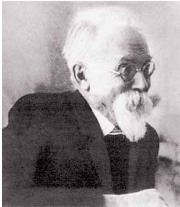
With the work of Russia’s Academician V.I. Vernadsky, modern, 20th-Century physical chemistry, for the first time, identified the crucially determining distinctions of physical principle among the three interacting categories: the abiotic-in-principle, Biosphere-in-principle, and the Noösphere.

Thus, from the vantage-point of this knowledge, the Earth is to be viewed, in functional terms, as composed of these three categorical features, defined such that the