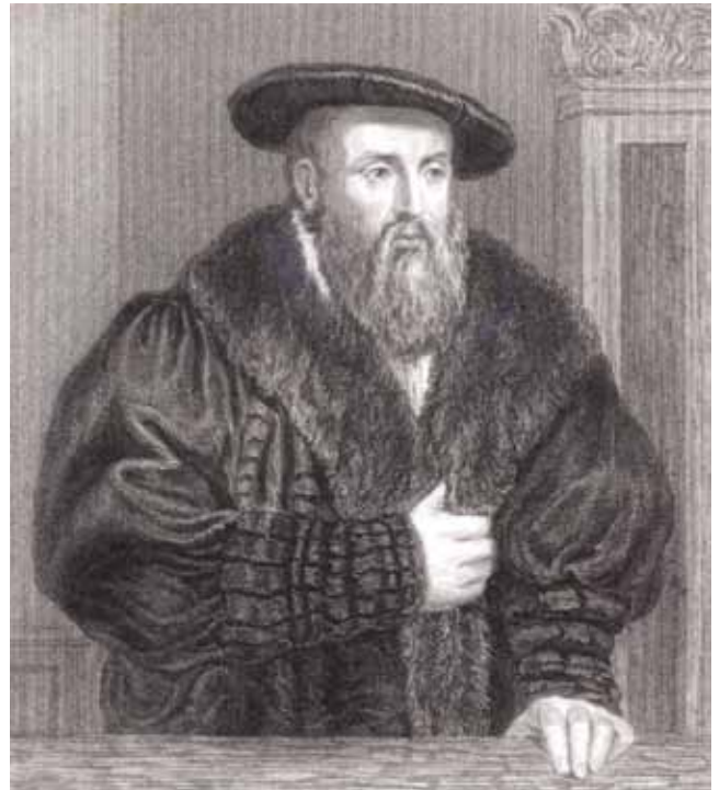
It was Kepler, and not the fraudster Newton, who made the uniquely original discovery of a universal physical principle of gravitation.

implicit in Pierre de Fermat's principle of least action (against Rene Descartes, et al.), the unique discovery of what is called properly the "ontologically infinitesimal" of Leibniz's discovery of the calculus, or, by Carl F. Gauss' refutation, as in his doctoral dissertation, of the fallacy of the anti-Leibniz hoax of Leonhard Euler, et al., respecting the Fundamental Theorem of Algebra. This is the same principle which underlies the entirety of the work of Riemann, and of the later work of Albert Einstein: all to be considered afresh, as we are obliged to do so in the aftermath of Riemann's presenting of his 1854 habilitation dissertation. 24