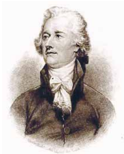
The U.S.A.’s first Treasury Secretary, Alexander Hamilton, was murdered by the British agent Aaron Burr, for his role in creating the “American System of political-economy.”

The habits associated with those assumptions and practice, “hedge-fund-like” stealing aside, have no functional correspondence to any useful, physical-economic function. However, because of the broad influence of the use of the special language of “economics” used as a rationale for the widespread practices and influence of the British empire, they have supplied many otherwise mutually differing bodies of opinion about economy, with what became a common special language of accounting for discussion among representatives of various proposed theories respecting human economic footprints. The consequent discussion proceeded without discovering the physical principle expressed by the actually walking man. Ordinary economists’ practice tells one of certain measurements and certain reportable conditions and events, but tells one virtually nothing of intrinsically physical-scientific interest about why an economy behaves as it