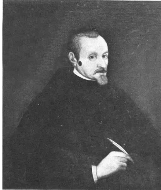
The new form of empire which emerged from the leadership of Venice’s Paolo Sarpi (above) spawned today’s Anglo-Dutch Liberal system, and unleashed the swarm of financiers at its core; the imperialist speculators in today’s petroleum “spot market” are the direct heirs of Sarpi’s model.

that the most essential of the keys to Sarpi’s reforms, is that he dumped the Aristotle whose barren doctrines had been the principal method of oligarchical “brain-washing” of European culture in earlier times, as replaced by the new form of oligarchical brain-washing, called Anglo-Dutch Liberalism, the so-called Liberal philosophy launched by Sarpi, and based on the medieval irrationalism of the William of Ockham whose lunacy is the central feature of modern logical-positivist dogmas.