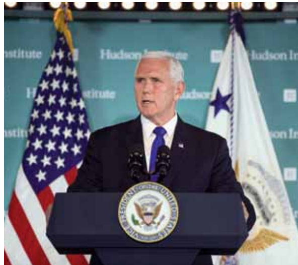
White House Vice President Mike Pence speaking about the Trump Administration’s policies toward China at the Hudson Institute on Oct. 4, 2018.