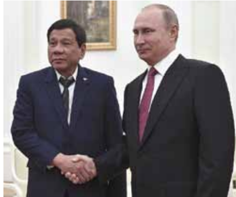
Philippines President Rodrigo Duterte has established friendly relations with Russia's President Vladimir Putin ...