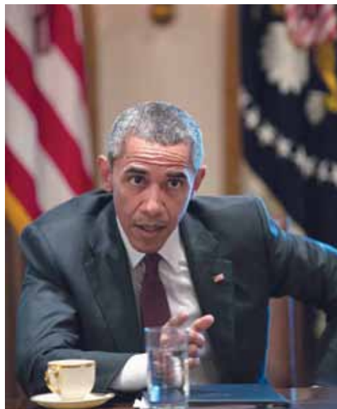
President Duterte rejected President Obama's demand for confrontation with China.

Now, we still believe that the United States left the Chinese free to do whatever they wanted in 1995, when they, the Chinese,