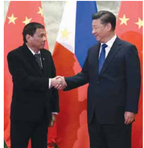
... and China's President Xi Jinping, while maintaining close ties with the U.S.

eration Agreement, signed in 2014] is moving along. We just inaugurated the first EDCA facilities at Basa Air Base in central Luzon. I think the next one will be on Palawan Island, facing the South China Sea. EDCA is a follow on to the Visiting Forces Agreement that we signed with the United States in 1998.