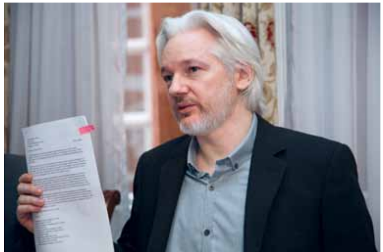
Julian Assange, founder of WikiLeaks, in 2016.