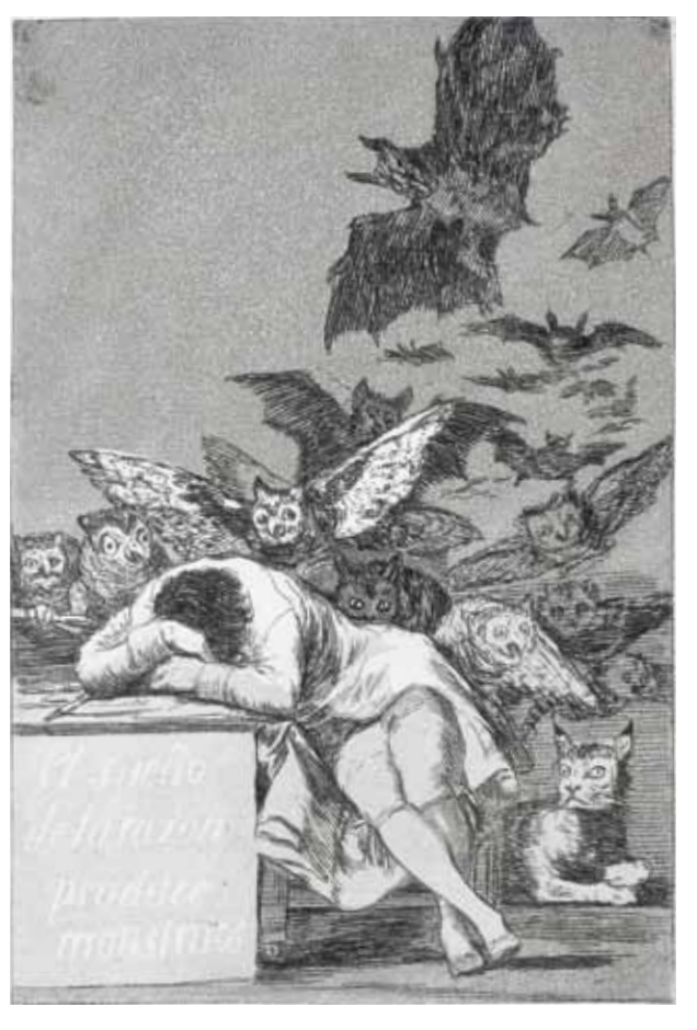
The Sleep of Reason Produces Monsters, by Francisco Gova.