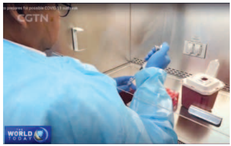
Universal testing for coronavirus is a necessity.

I can only repeat: Only if we take an approach to fight this pandemic in the way it has to be fought, is there any hope to contain it, without millions and millions dying. There will be millions of people dying, but there must be absolutely the approach we have been pushing for, for several weeks now, and we will escalate that: To now have a world health system —that a health system must be built up in every country on what used to be the standard under the Hill-Burton Act in the United States, or as it used to be before Germany and France privatized their health systems, which used to be very excellent health systems before the privatization. We need to have an international mobilization to accomplish that.