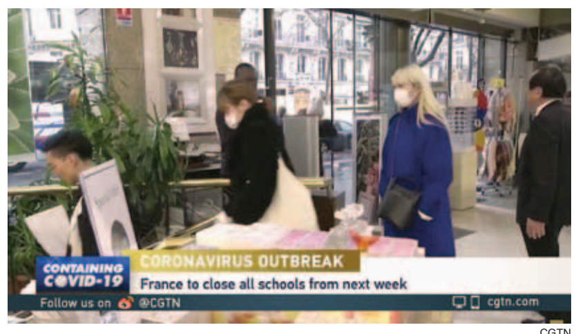
France is now locked down.

Then you have a middle ground sort of thing in Germany, where on the on side there is no question that the authorities know the seriousness of the situation, because there are warnings of worst-case scenarios, that if they do not get the pandemic under control, Germany will have a collapse of the system and a takeover by anarchy. In Italy, where over 10,000 medical caregivers