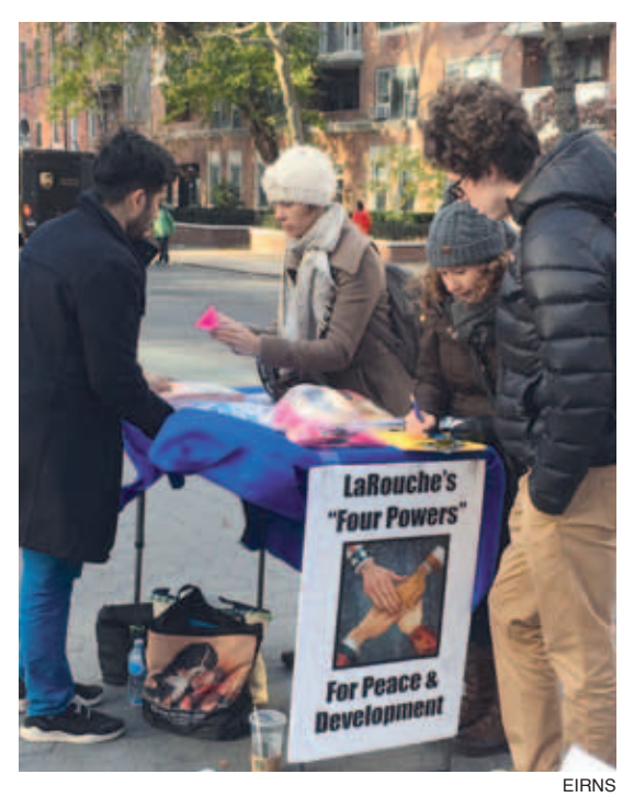
LaRouche PAC organizes support for LaRouche's call for a Four-Power Summit, the first step toward a New Bretton Woods monetary system. New York, November 14, 2018.

To understand the danger and the promise of the days ahead, reflect on what Abraham Lincoln accomplished, by not only preserving the Union, but by reestablishing the American System—during a Civil War!—and unleashing a mighty industrial revolution that became the paradigm for the world. By the onset of the 20th Century,