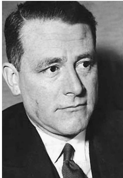
Nazi Crown Jurist, Carl Schmitt, who wrote the enabling legislation legitimizing Chancellor Hitler’s dictatorship.

A red line was crossed October 14. This is a turning point. The means for ending this coup lie in an overwhelming mandate for this President, and that is what you must organize your fellow citizens to bring about now. This transgression must not stand.