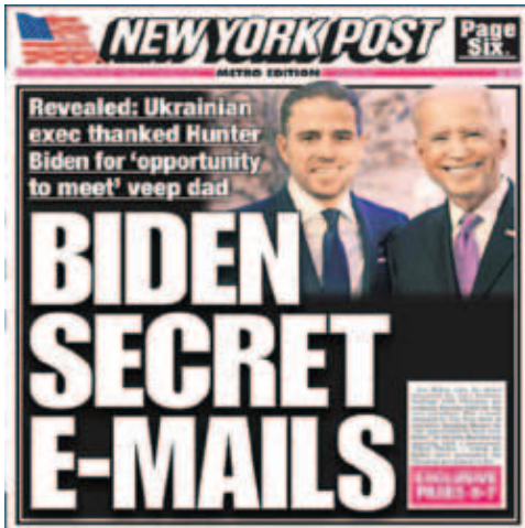
What they didn't want the public to know: the New York Post breaks open the scandal of Hunter Biden's corrupt business deals, that his Vice-President dad knew all about.