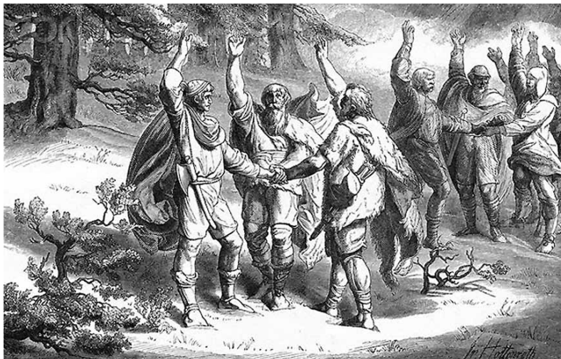
Friedrich Schiller's drama, Wilhelm Tell, poses the question: Will a people accept a tyranny, or shed it? Here, men swear the famous Rütli Oath to "seize their eternal rights" and defend their country against a tyrant's power. At left: Friedrich Schiller.

But otherwise, I think the idea of the Declaration of Independence, that a point has been reached, where there is enough that this must end; and the idea of Fried-