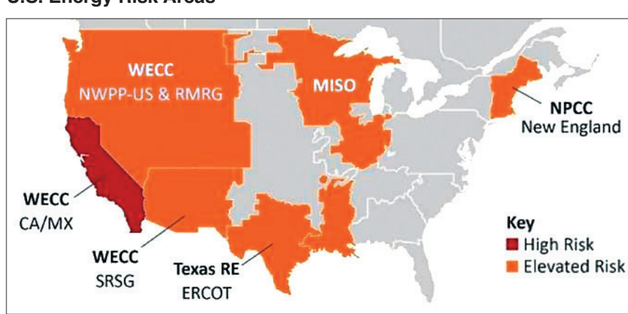
Map by U.S. Energy Information Administration, based on North American Electric Reliability Corporation (NERC) 2021 Summer Reliability Assessment.

powerful, it was on a par with the Davos Forum—a 50-year institution—except that the Schiller Institute event was for the good, and Davos is a bunch of billionaire elites.