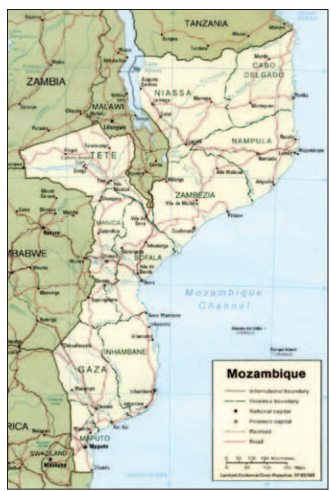
UT/Perry-Castañeda Library Map Collection

In the June 11-13 Summit of the Group of 7 (G7) in Cornwall, England, the leaders of the Group launched what they termed the "Build Back Better World (B3W) Partnership," an "initiative" that is supposed to deal with the massive deficit in infrastructure in the developing sector. According to the fact sheet of the B3W Partnership released by the White House, the initiative is aiming at "a values-driven, high-standard, and trans-