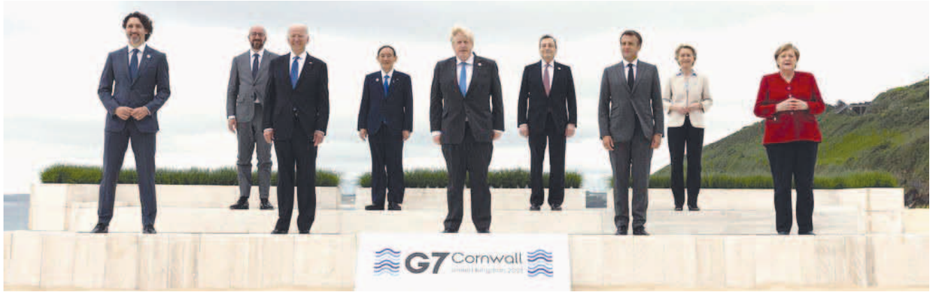
The G7 leaders pose at their June 11-13 Summit in Cornwall, England.