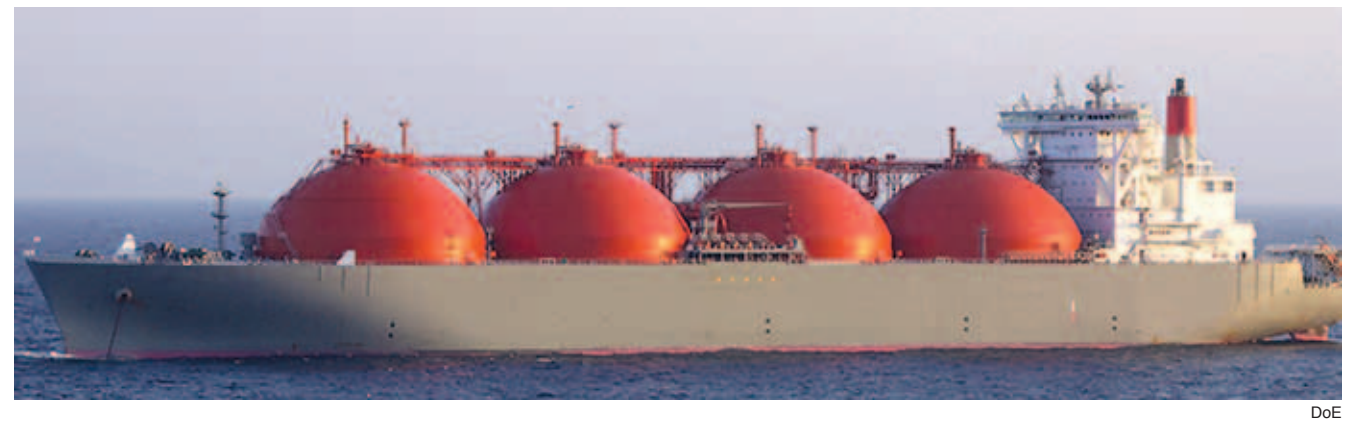
A liquified natural gas (LNG) tanker ship.

Today, President Biden met with G7 leaders to discuss strategic competition with China and commit to concrete actions to help meet the tremendous infrastructure need in low- and middle-income countries.