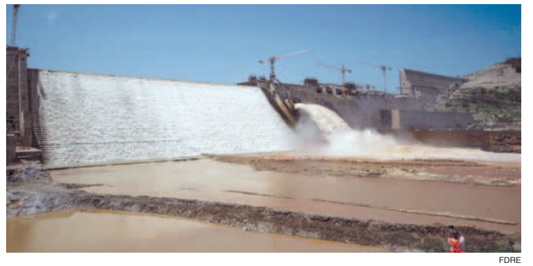
Financed by government bonds and private donations, the Grand Ethiopian Renaissance Dam (GERD) runs counter to the colonial policy of regarding Africa as only a source of raw materials.

structure in developing nations make it impossible to launch any significant projects. One such standard, which China and the BRI are being accused of violating, is "fiscal responsibility," which basically means that if a nation is poor and in debt, it should not build large-scale infrastructure, nor borrow money to do so. Western institutions. like the World Bank (WB), stopped financing major