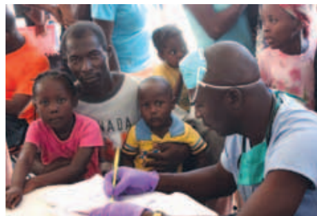
A family receiving medical attention in a Port-au-Prince clinic after the 2010 earthquake.

loaded onto rail cars and sent to their deaths, it does evoke the image of the racist Thomas Jefferson, who after becoming President in 1801, made known that once the warring nations of Britain and France made peace, the U.S. would act in concert with them “to confine the [Negro] pest” to the island of Saint Domingue [now Hispaniola] where Haiti is located.