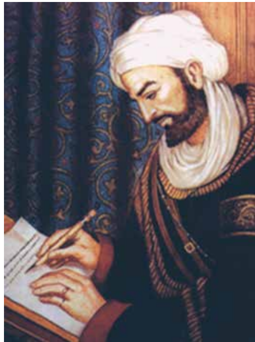
Ibn Sina (c. 980-1037)

Even before the pandemic, the production of grain per capita—a metric of sufficiency—was declining worldwide, and 800 million people were what were called “food insecure,” that is, having a limited or uncertain access to adequate food—in plain talk, hungry. That has only worsened, to where 43 million people are now on the edge of starvation, and others in acute need. The whole continent of Africa has been insanely made import-dependent for 40% of its grain