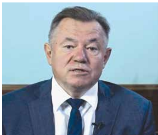
Dr. Sergei Glazyev

Already 30 years ago, and perhaps even earlier, Lyndon LaRouche drew attention to the fact that the inflation of financial bubbles, including derivatives bubbles, and the creation of financial pyramid schemes would in-