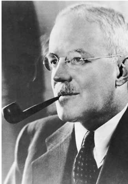
Allen Dulles, the CIA Director that Kennedy had fired, was brought in to orchestrate the Warren Commission proceedings to cover up the truth about his assassination.

After the Kennedy assassination, all kinds of irregular things happened. The Warren Commission was set up by Lyndon Johnson. Who did they pick to pretty much orchestrate the whole commission proceedings? It was Allen Dulles! Allen Dulles pretty