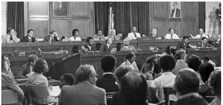
U.S. House of Representatives The U.S. House Select Committee on Assassinations met from 1976 to 1978, ostensibly to investigate the assassinations of Martin Luther King and President John Kennedy. They endorsed the Warren Commission findings that the FBI, CIA, and Secret Service were not involved.

Both parties are equally corrupt in all this; both