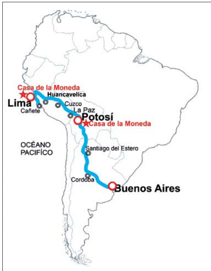
The Silver Route from the mines of Lima to the Atlantic seaport of Buenos Aires, the most important trade axis of the Spanish colonial period.

This is why the imperial appetite in the region has such a long history. From the first years of the colonial period, in their search for sources of gold and silver, the Spaniards rediscovered the enormous veins of gold and silver along the Andean plateau of the Collao region (today part of Peru's Puno department) that borders Lake Titicaca. Around 1545, they discovered Potosí's