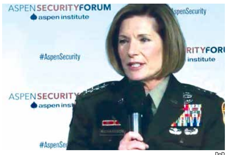
Gen. Laura Richardson, Commander, U.S. Southern Command

These statements are an updated version of the neocolonial policies that Henry Kissinger enunciated in his infamous National Security Memorandum, NSSM 200 in 1974. They leave no doubt that the warhawks that run the United States today intend to eliminate every obstacle to implementing those Malthusian,