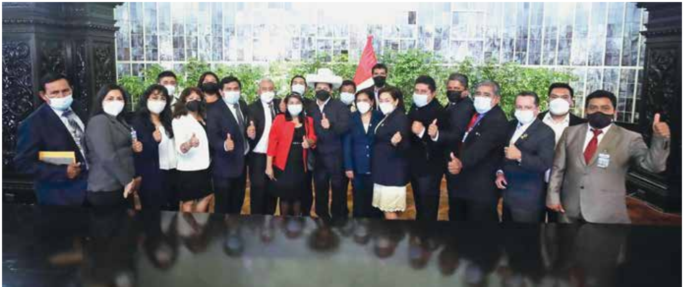
Presidency of the Republic of Peru/Juan Carlos Guzmán Negrin

The Covid-19 pandemic then broke the system and revealed the miserable living conditions in which the vast majority of Peruvians lived. Absent a public health system or intensive care capability in hospitals, and without even the ability to produce medical oxygen, Covid-19 deaths rose to the hundreds of thousands. According to conservative official data, in relative terms (deaths per 1,000 inhabitants), Peru had, in worldwide terms, the most deaths due to the pandemic. The reality is that deaths from the pandemic approached half a million, and there is practically no Peruvian family that didn't lose at least one family member as a