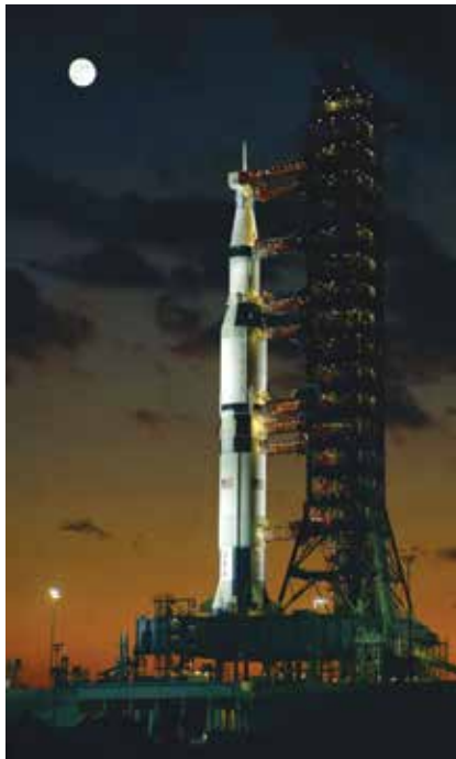
NASA Because the human being can hypothesize, we have the power to transform our environment beyond Earth. Here, a Saturn V rocket is readied to launch the Apollo 4 mission, Nov. 8, 1967.

Let's now take one more step ahead: the so-called revolution of Artificial Intelligence, AI. AI processes data and establishes logical correlations, "learning" to induce and deduce in domains with an enormous but finite number of cases. It does not know what it is really doing physically, it is not self-conscious. True, it can win over a human rival in the board games of chess or