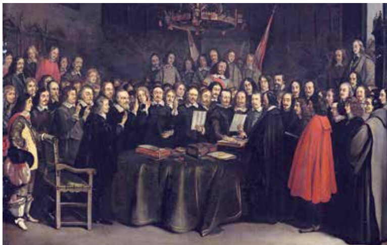
Gerard ter Borch

The mind is a compact cognitive mass [ Geistes-