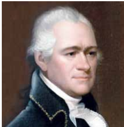
Portrait of Hamilton by Ezra Ames (detail) Alexander Hamilton

At the New York convention called to vote on ratifying the U.S. Constitution, Alexander Hamilton poked holes through the sophistry of those who argued that the new Federal government would threaten the existence of the states. Below are brief excerpts from his speech of June 27, 1788. The full text is available through the Library of Congress archive .