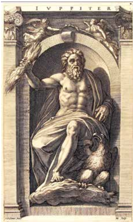
The “bestially evil traditions of cannibalism of the legendary Zeus, the Roman Empire, and the present British empire and its influence on other nations” are the most deadly threat to humanity, LaRouche writes. This image of Zeus (Jupiter) is by Polidoro Caldara da Caravaggio (1495- 1543).

Modern British empires. That distinction is not merely a distinction from animals of the human species; it is, rather, the absolute distinction of the human species from all presently known others. Only mankind willfully breeds itself to become a species of a higher physical and moral capability.