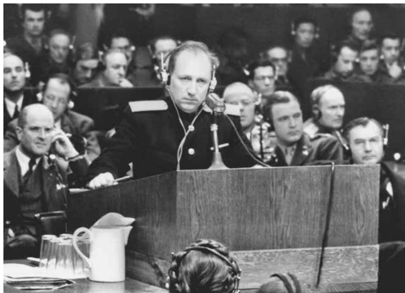
Ministry of Defense of Russia

Our film, of course, will not be a chronicle of a trial or a lecture on history. In the center of the narration is the story of a young guy, a translator who became a soldier during the war years and who, by the will of fate, found himself in the thick of events related to the International Military Tribunal. And we will see these events through his eyes—not only what happened in the famous “Room 600,” where the Tribunal sessions were held, but also conspir-