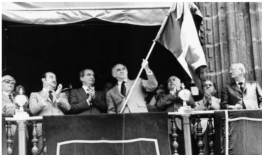
Coordinación de Material Grafico

Zepp-LaRouche: Oh, that was a very good thing. In 1982, when the Wall Street banks had organized an incredible capital flight out of Mexico, President López Portillo called in Lyndon LaRouche to help him to defend the Mexican economy against such manipulations. We flew to Mexico and within less than three