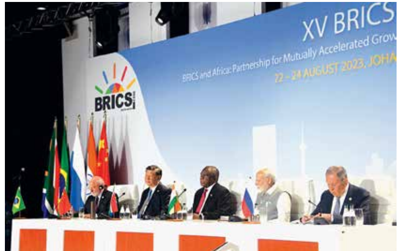
Cyril Ramaphosa, President of South Africa and host of the BRICS Summit (center), speaking during a media briefing, Aug. 24, 2023.

Now, if you read what these ridiculous newspapers were writing about it, they said, “The only reason why the Indians are happy is because the Russian experiment a few days earlier failed, and the Indians are now happy that they are superior...” It’s not true! That did not happen! There was an incredible sense of joy by everybody, and I think the West is just completely hysterical because they do not want to reflect on their ways.