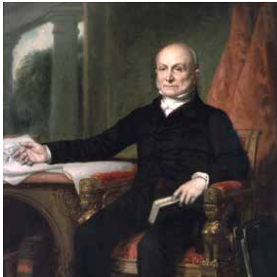
George Peter Alexander Healy

That’s the danger we face, and that’s why we should be strongly mobilized, and you should make a decision that you will become active to—you know, in a period like this when it’s very clear that we are in a transformation, as I keep saying, once in a thousand years—because the period of colonialism was 600 years and that is definitely coming to an end, and it will end either with the extinction of all of civilization, or a new era of mankind in which we all live together, fo-