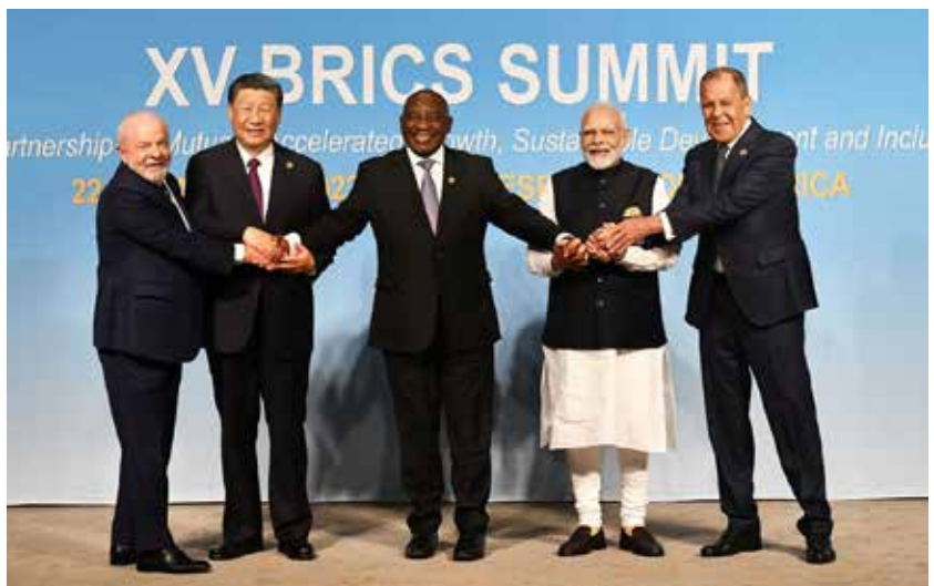
The 15th BRICS Summit marked a tectonic shift in global relations. Shown: the leaders of the five BRICS nations. Six additional nations were admitted at the summit in Johannesburg, South Africa, Aug. 22–24, 2023.

But that will probably require a few more shocks, because right now it's ridiculous. I would advise our viewers, that is, you: do not just read what the Washington Post or the New York Times or some other liberal paper is saying about the BRICS: Go to the internet, download the speech of South Africa's President Cyril Ramaphosa , of Brazil's President Luiz Inácio Lula da Silva , of India's Prime Minister Narendra Modi , of Chi-