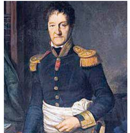
Louis François Lejeune

“National defense which emphasizes universal military training inspires second thoughts in the minds of ambitious aggressors and shatters the arrogant dreams of plotting tyrants, contributing to peace, and to true democracy”: Left to right: Gen. Gerhard von Scharnhorst, Benjamin Franklin, and Lazare Carnot.