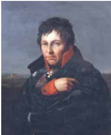
Circle of Friedrich Bury

That republican military policy is not what the backers of “conventional build-up” are proposing.