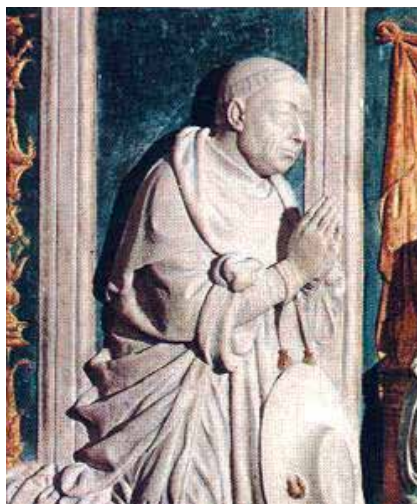
Sculptor: Andrea Bregno

in the West, because this was regarded as a big clash of civilizations, like an early form of what Bernard Lewis was trying to promote as one of these geopolitical string-pullers that Putin was talking about. Because at that point the Christian world was convinced that it was a barbarian attack—from the Muslim side, it looked very different—But there was bloodshed, and it was a huge shock.