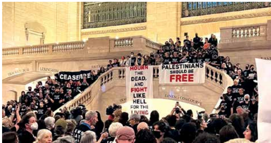
X/Jewish Voice for Peace

Mass demonstrations are becoming a daily phenomenon. In the United States, a Nov. 4 national rally on the Mall in Washington, D.C. is reported to